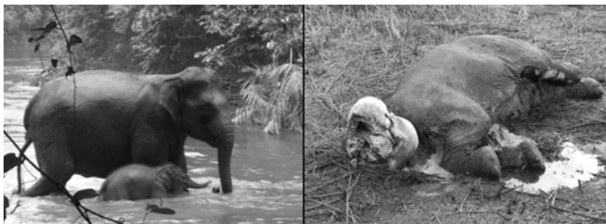
Fig. 2. Sumatran elephants in Bukit Tigapuluh: a cow with calf following her herd into the dense jungle after taking a bath and feeding on water plants (left), and the already decaying remains of a subadult bull that was shot by poachers in order to cut off his small tusks (right).